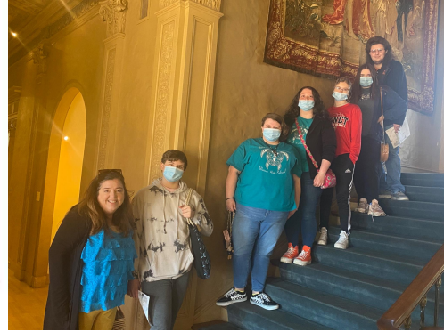
NASA students pose for a picture at the Philbrook.

Museum the NASA students were able to enjoy a meal at P.F. Chang's, downtown at Utica Square, and stopped for some treats at a nearby bakery called Antoinette's. Finally, the students went to visit the Reconciliation Park in the Greenwood area of Tulsa where the Creek Indians were after walking the Trail of Tears.