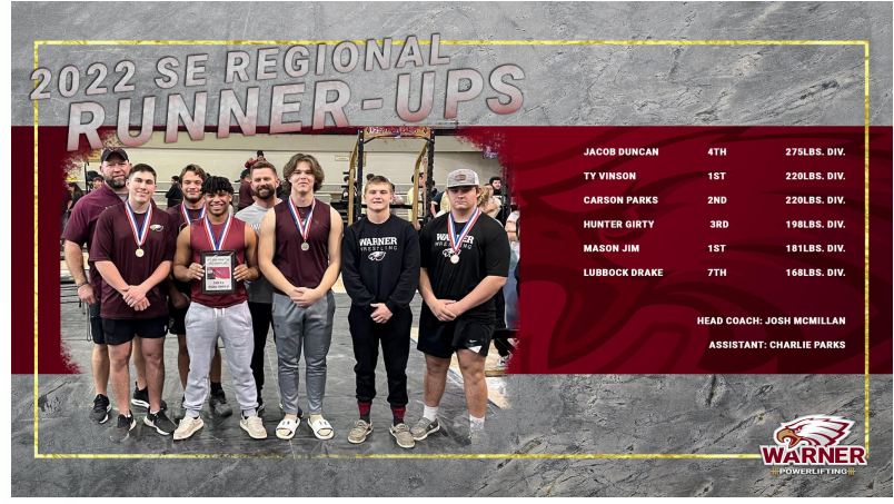
The graphic above lists the results from the Regional Powerlifting Meet.